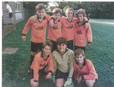
Our 'Sainsbury's Squad'